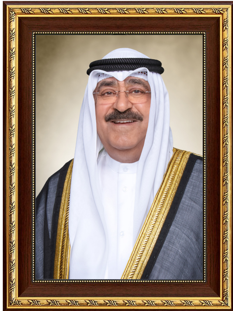
H.H. Sheikh Meshal AL-Ahmad Al-Jaber Al-Sabah Amir Of The State Of Kuwait